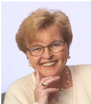
Gov. Barbara Roberts Former Governor of Oregon